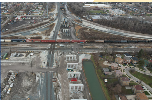
Aerial view of P3 flyover site