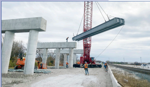
Workers adding support beams to P3 flyover structure