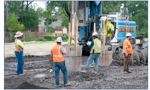
Workers drill shafts for P3 flyover project

5. Project P2 ROW Assessment Services - Project P2 will create a Metra flyover structure connecting the Southwest Service (SWS) line