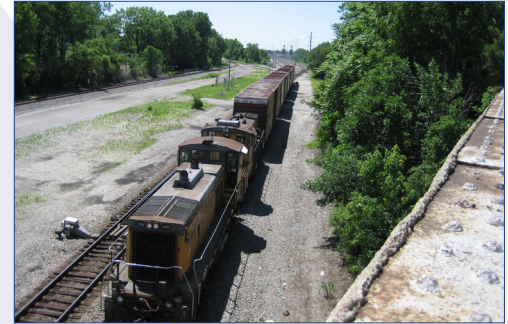
Existing conditions P2 project

with the Rock Island District (RID) line. This new structure will require right of way acquisition, and Metra issued a Letter of Interest and Qualifications (LIQ) in April 2022 for related professional services. Metra and other professional services consultants also continue to prepare final design plans for this work.